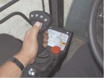
Electronic Joystick Control with Proportional Valves